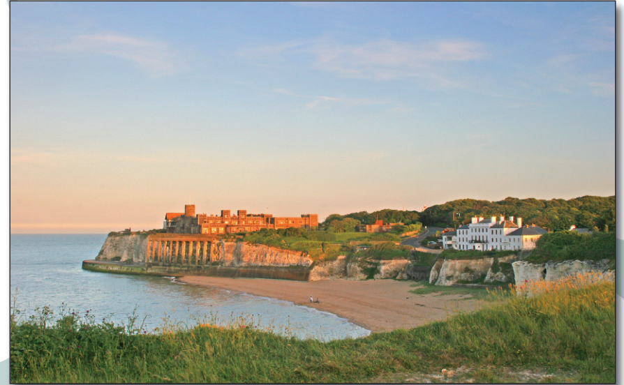
Kingsgate from clifftop.