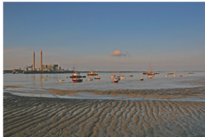
Evening Light. The low evening sun at Gravesend catches the mud ripples and lights up the anchored yachts, with Tilbury power station in the background.