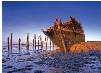
The Wreck. A wrecked decaying barge lies abandoned on the shoreline of the River Thames and can be seen from the Saxon Shore Way at Higham marshes.