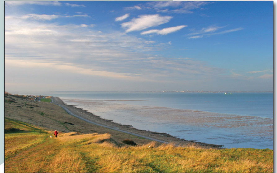
Royal Oak Point.